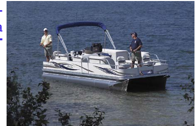
Come join the fun in the sun July 14 at Spend-a-Day Marina

This year’s event is expected to be bigger and better so register early with Spend-a-Day to ensure your opportunity for a GREAT DAY AT THE LAKE!!